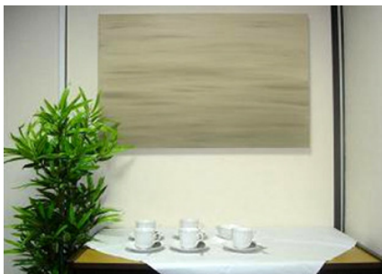
Artsorption Absorption Coefficient