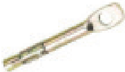
Tie Wire Bolt